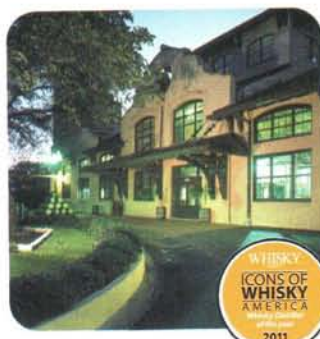
WHISKY DISTILLER OF THE YEAR ICON

In what has been an interesting year we hope that you will celebrate the diversity the industry has to offer and join us in congratulating the winners.