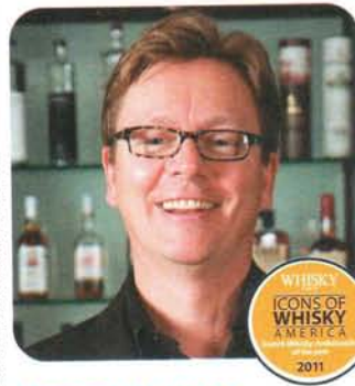
SCOTCH WHISKY AMBASSADOR OF THE YEAR ICON