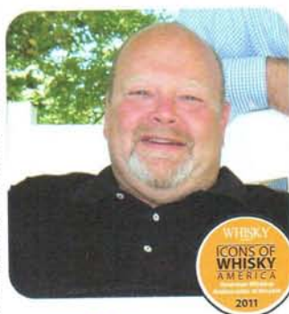
AMERICAN WHISKEY AMBASSADOR OF THE YEAR ICON